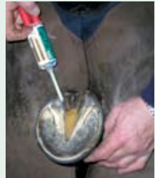
Dispense Equi-Pak CS