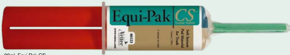
20ml. Equi-Pak CS