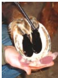
Dispense SoleGuard onto a clean, dry sole