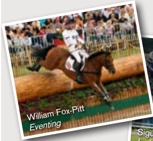
William Fox-Pitt Eventing