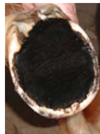
Complete foot protection and support